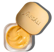
#5 Farsali Haldi Eyes