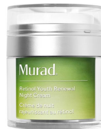
#4 Murad Retinol Youth Renewal Night Cream