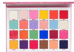
#4 Jeffree Star Cosmetics Jawbreaker Palette