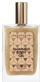
#2 Anastasia Beverly Hills Shimmer Body Oil