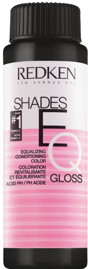
#1 Redken Shades EQ Color Gloss Hair Color