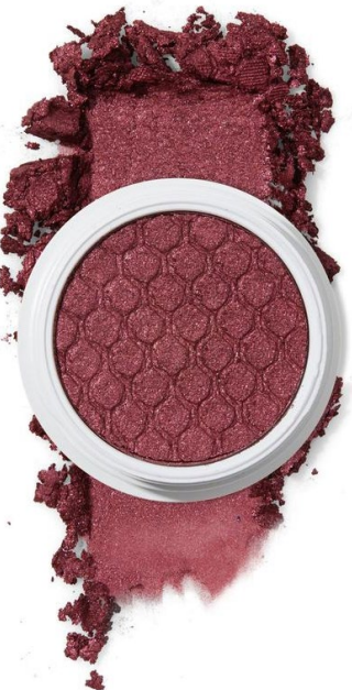
#1 ColourPop Cosmetics Super Shock Shadow