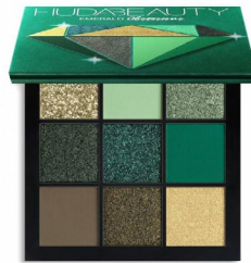
#3 Huda Beauty Obsessions Eyeshadow Palette