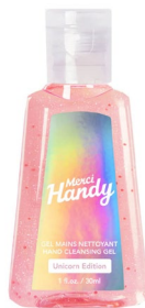
#3 Merci Handy Hand Cleansing Gel