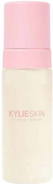
#1 Kylie Skin Foaming Face Wash