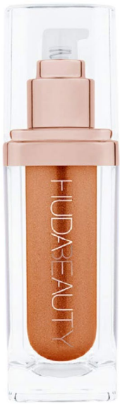
#1 Huda Beauty N.Y.M.P.H. Not. Your. Mama's. Panty. Hose