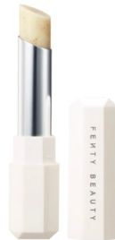
#3 Fenty Beauty by Rihanna PRO KISS'R Lip Loving Scrubstick